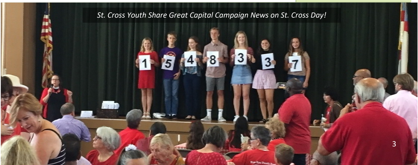
St. Cross Youth Share Great Capital Campaign News on St. Cross Day!

South Bay PFLAG Chapter Arrives - PFLAG is the nation's largest family and ally organization for people who are LGBTQ along with their families, friends, and allies. Monthly support group meetings on first Tuesdays from 7-9 PM in the Fireside Room, Manhattan Beach Community Church, 303 S. Peck Ave., Manhattan Beach.