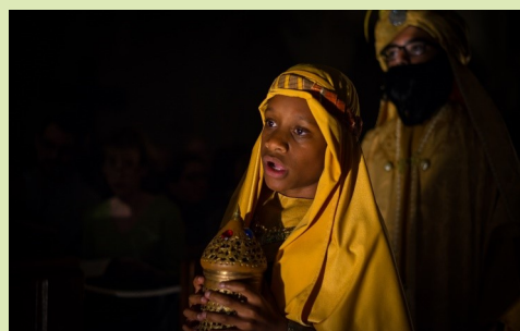
Scenes from last year's St. Cross Christmas Pageant