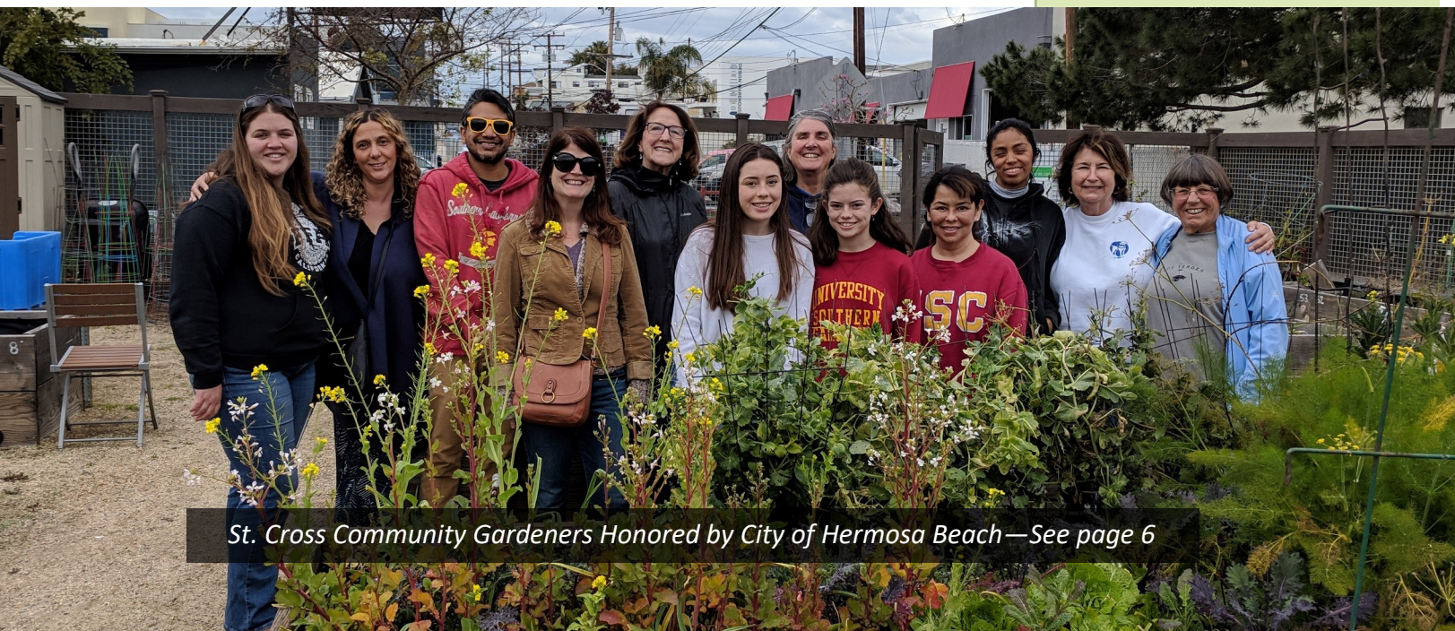
St. Cross Community Gardeners Honored by City of Hermosa Beach—See page 6