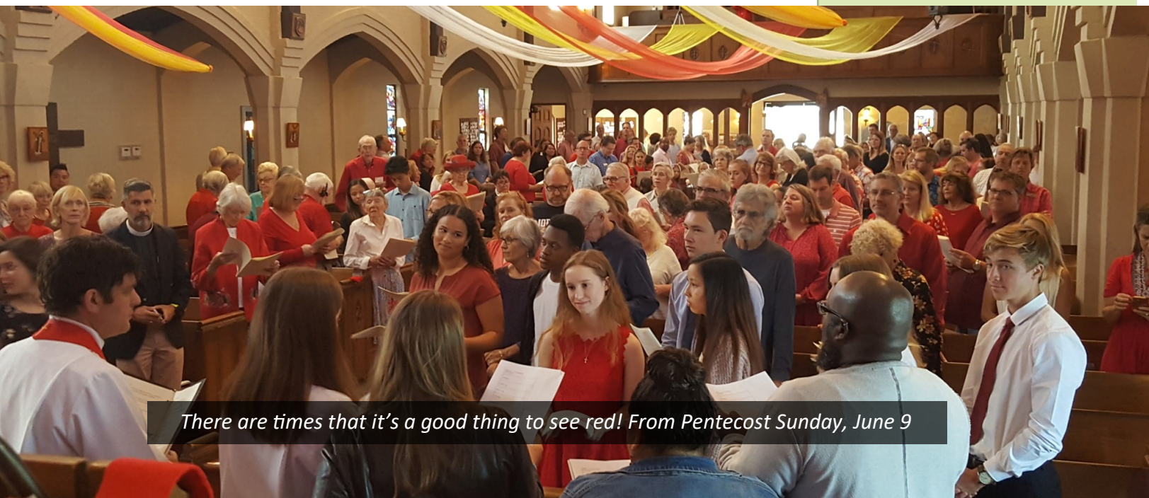
There are times that it's a good thing to see red! From Pentecost Sunday, June 9

Sign up for our weekly email at stcross.org !