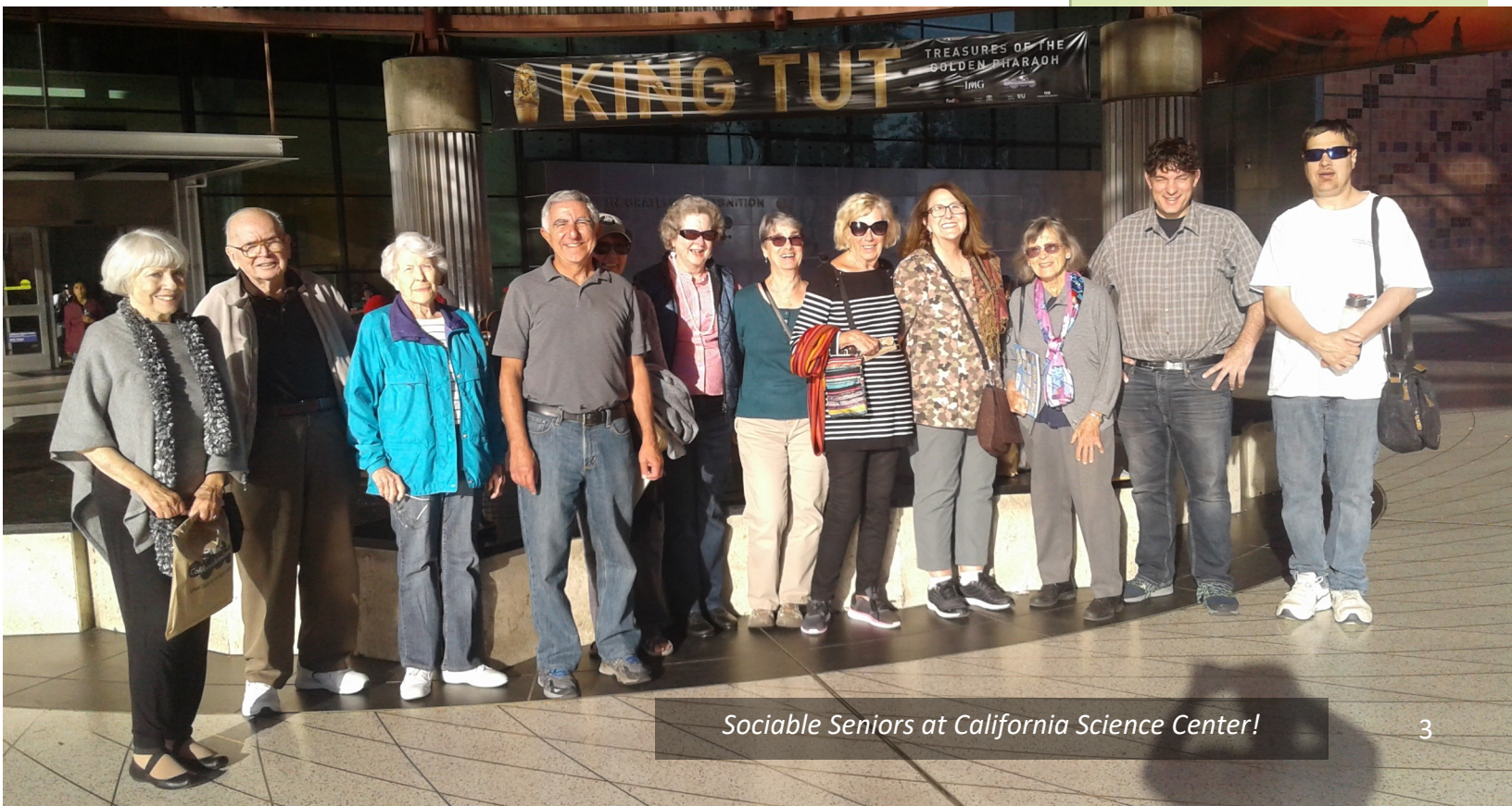
Sociable Seniors at California Science Center!