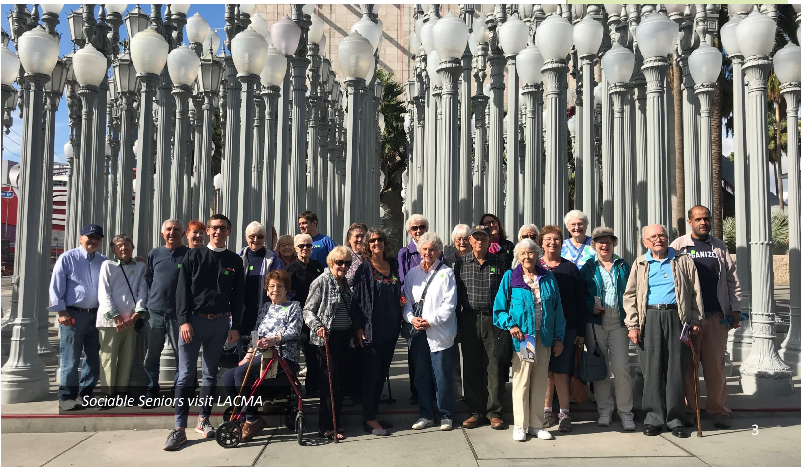
Sociable Seniors visit LACMA

Learn more about Giving Tree in History, page 6.