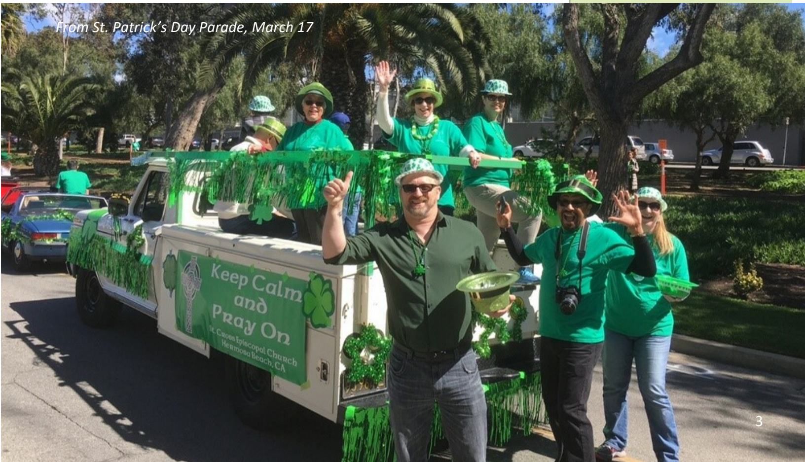
From St. Patrick's Day Parade, March 17